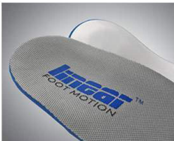
3mm Polypropylene Shell With Intrinsic Forefoot Post